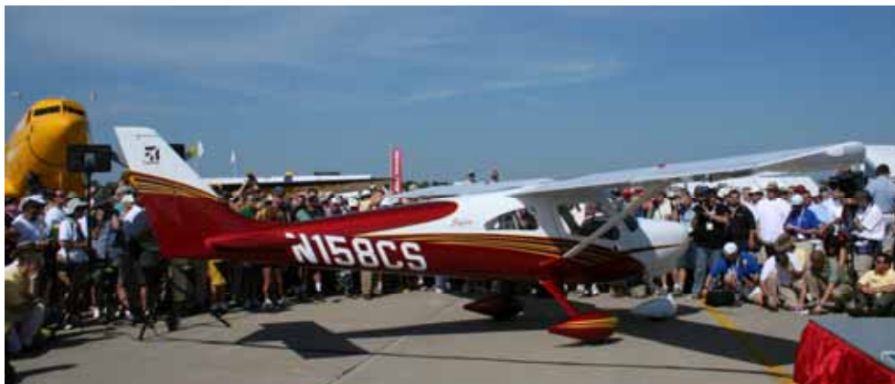
The unveiling of the Cessna Sport C158