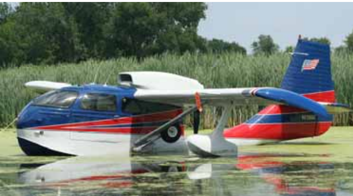
Republic Seabee moored in cove