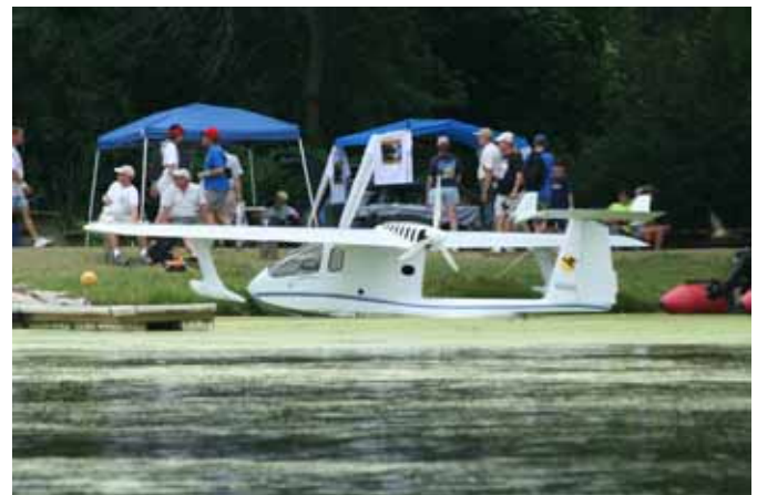
Above: Manufacturers display their latest wares