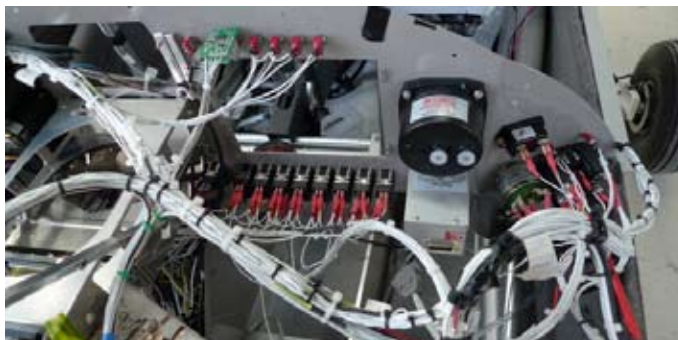
The fledgling displays it's well constructed and very neat nervous system.