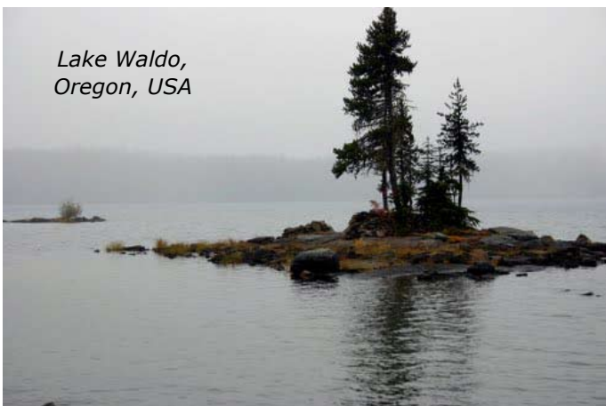
Lake Waldo, Oregon, USA

"It is important that seaplanes continue to receive this right of access to navigable lakes and rivers, so that they can continue to be a practical mode of transportation. Many citizens and planners are not aware that seaplanes can provide a much lower carbon footprint than automobiles, since they do not require the extensive infrastructure necessary to build and maintain highways, which has an enormous added carbon footprint. The seaplane's infrastructure is simply the existing healthy clean waterways, the same as what is needed for wildlife and recreation uses."