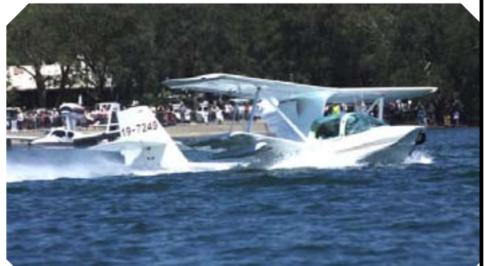
Phil Lee's Super Petrel at Rathmines