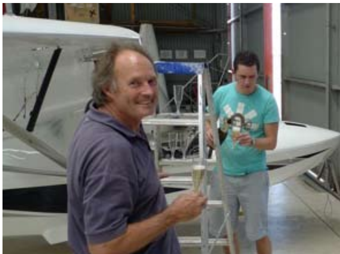
The smile of a very proud father!