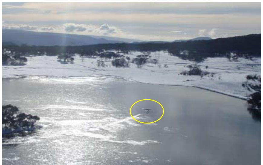
Three Mile Dam, near the historic town of Kiandra, in the Snowy Mountains, has an elevation of 4,882ft.

If you can get it onto the step and you have enough water in front of you (a lot!) you will probably get it