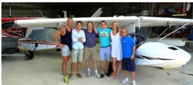
Much joy is evident after an uncomplicated birth. (attaching the wings)