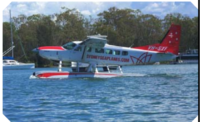
Sydney Seaplanes, Cessna Caravan at Rathmines