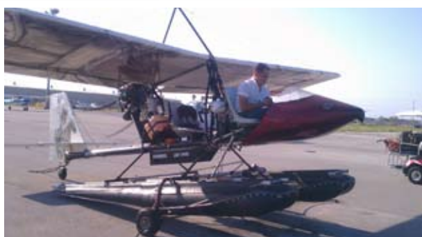
A drifter on floats

On The Step is distributed free to all members of the Seaplane Pilots Association of Australia (SPAA) Stories, articles, photos and news are welcome and should be sent to: editor@seaplanes.org.au. Joining the Seaplane Pilots Assoc is easy, visit the website, click the Join Here button.