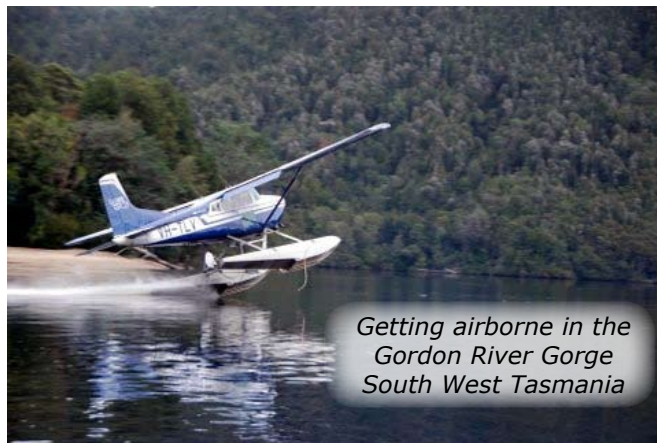
Getting airborne in the Gordon River Gorge South West Tasmania

But our 2007 trip had whetted our appetite to see more of Canada. So we returned in 2010 to take a 7 day cruise from Vancouver to Alaska. It was awesome! We had a cabin with a balcony and would lie at 'night' with the curtains wide, watching glaciers move past in the long days of sunlight. Tasmania's glacial history was thousands of years ago and leaves a great deal to the imagination on how the huge ice caps shaped our land. In Alaska the glaciers are alive, and their power