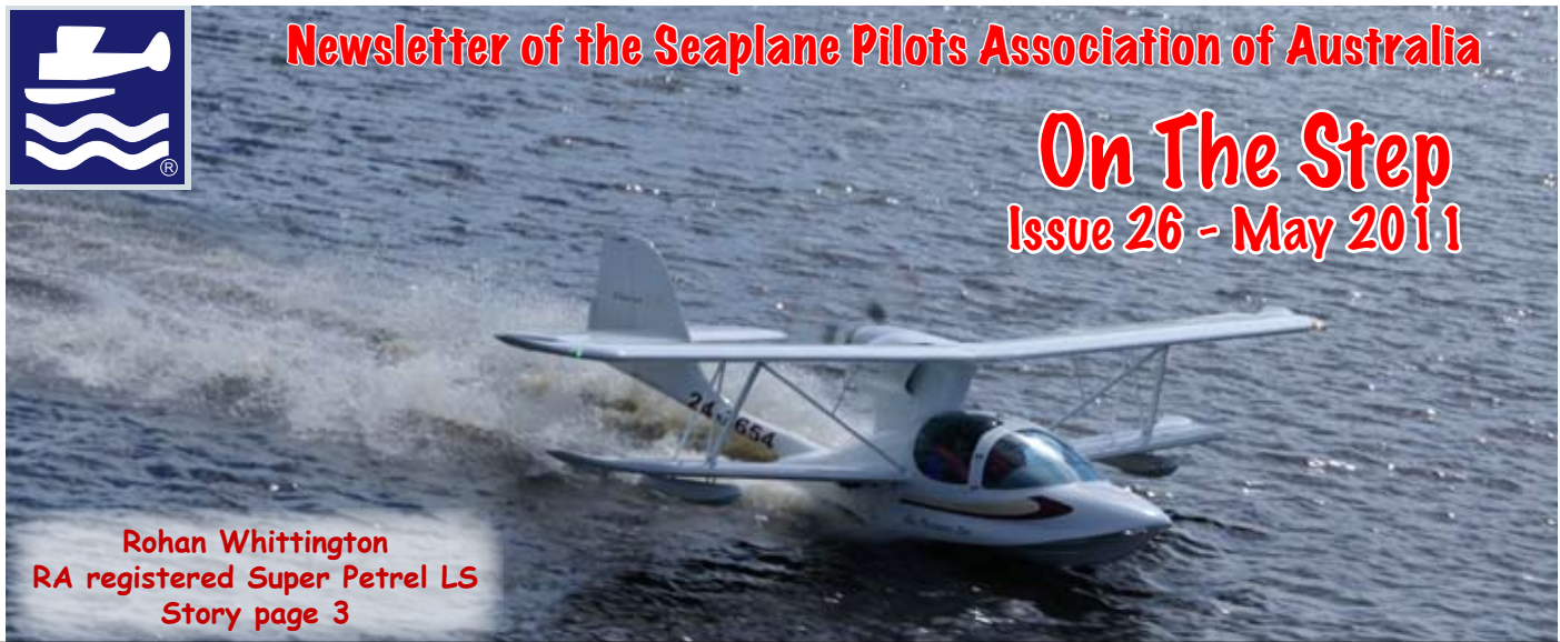
Rohan Whittington RA registered Super Petrel LS Story page 3