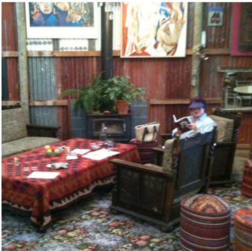
The hangar has been refurbished into a rustic, arty and comfortable lunch spot, and it's right beside the strip!