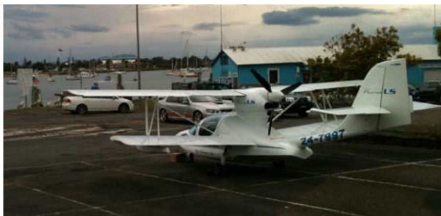
In the car park at Port Macquarie