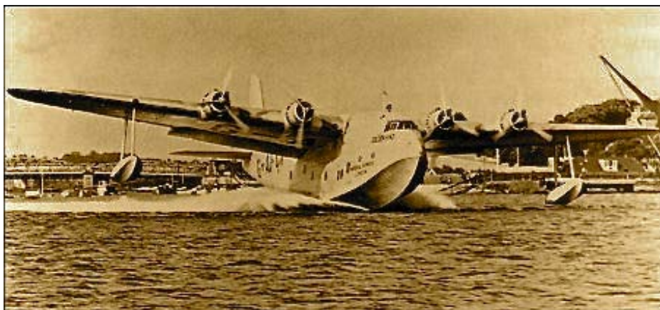
The gracious lines of the Golden Hind are apparent in this view of her first take off, Rochester, July 21, 1939 (Flight 17534s)

she swung the other way; eventually I got her straight and started to push the throttles wider. Golden Hind shot from the water like a leaping salmon.