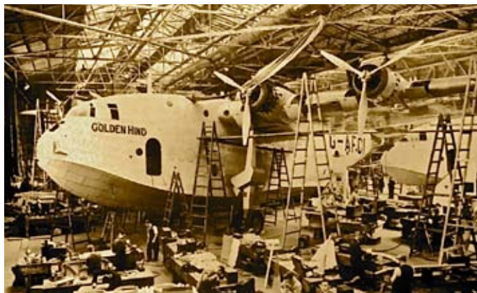
The Golden Hind nears completion at the Short Works in Rochester; in June 1939. The second of the three G-Class boats is evident on the right.

Apply to Fleet Airways, High Street, Chatham, Kent.