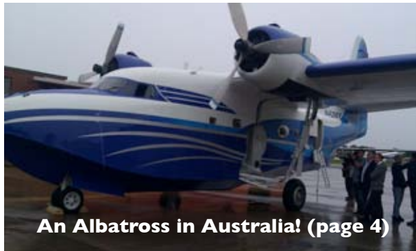
An Albatross in Australia! (page 4)