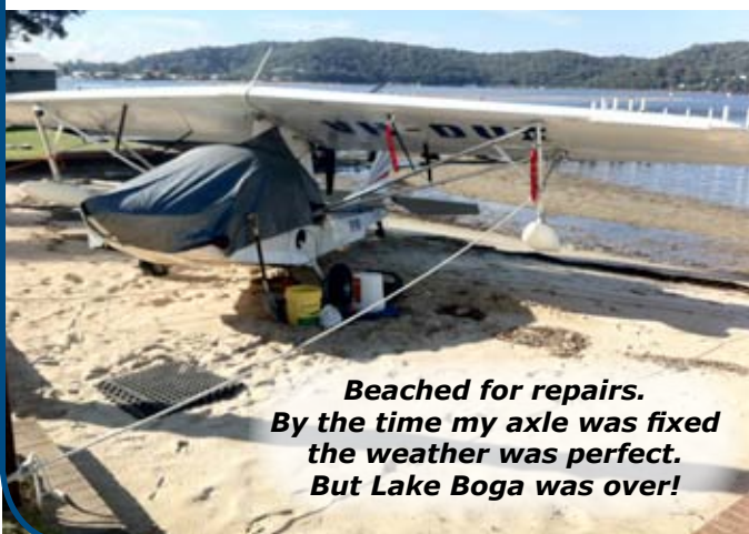
Beached for repairs. By the time my axle was fixed the weather was perfect. But Lake Boga was over!