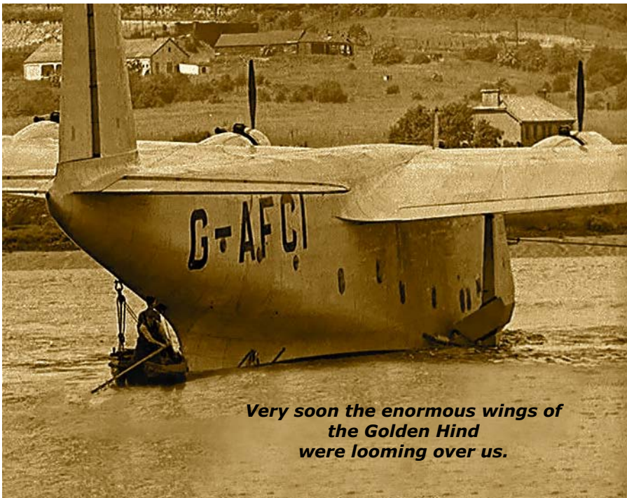
Very soon the enormous wings of the Golden Hind were looming over us.

"Outers warm!" said the engineer in a few minutes.