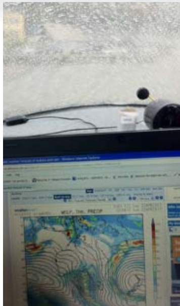
The view out my windscreen as I contemplated departing the Sydney Basin