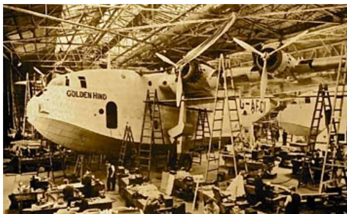
The Golden Hind nears completion at the Short Works in Rochester; in June 1939. The second of the three G-Class boats is evident on the right.

Apply to Fleet Airways, High Street, Chatham, Kent.