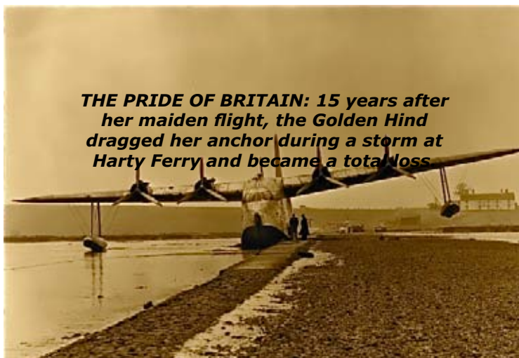
THE PRIDE OF BRITAIN: 15 years after her maiden flight, the Golden Hind dragged her anchor during a storm at Harty Ferry and became a total loss

Sadly, however, Fleet Airways never found the capital they needed for their venture, and as the months passed Golden Hind remained at Rochester. I tried to help by getting the newly-founded Aquila