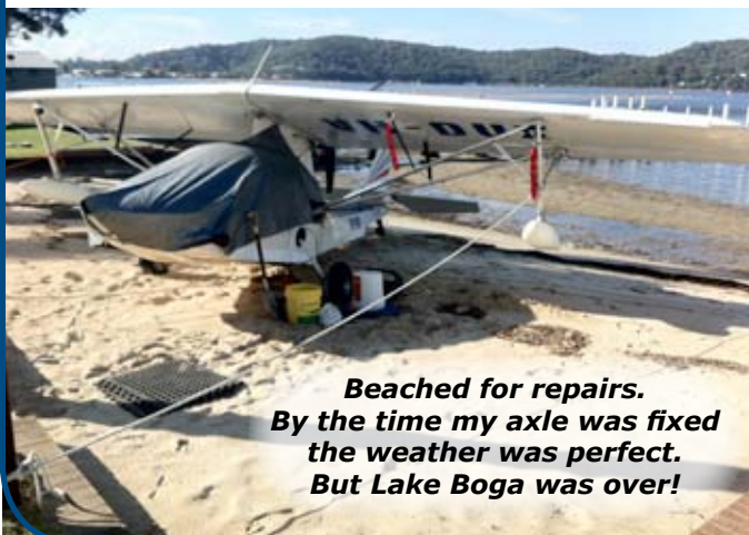
Beached for repairs. By the time my axle was fixed the weather was perfect. But Lake Boga was over!