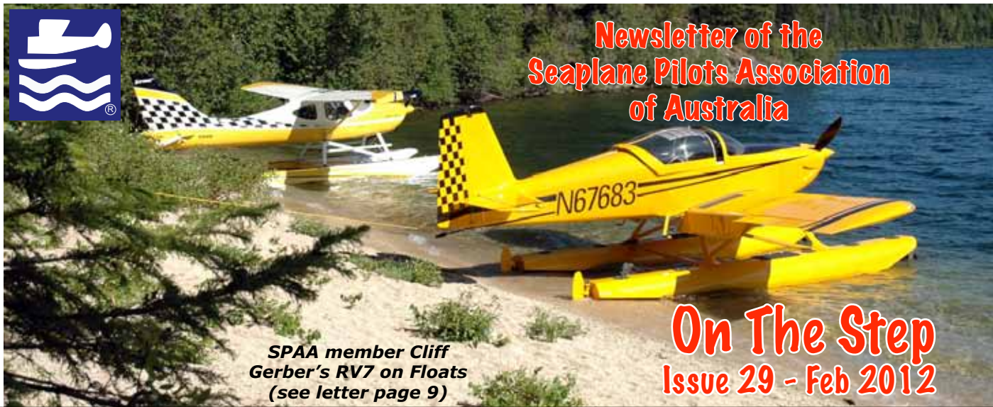
SPAA member Cliff Gerber's RV7 on Floats (see letter page 9)