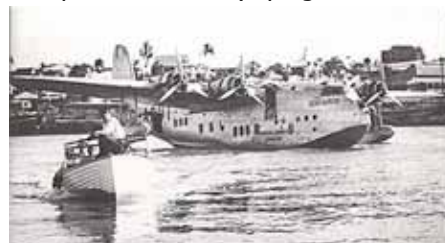
Empire Flying Boat "Centaurus" on the Brisbane River 1937