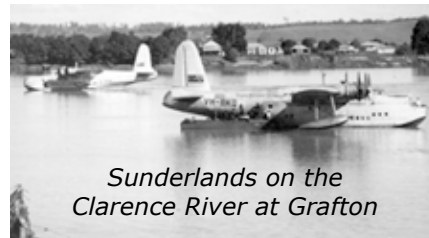
Sunderlands on the Clarence River at Grafton

I was too young to remember it but she tells me that I cried the entire time and was sick all over her!